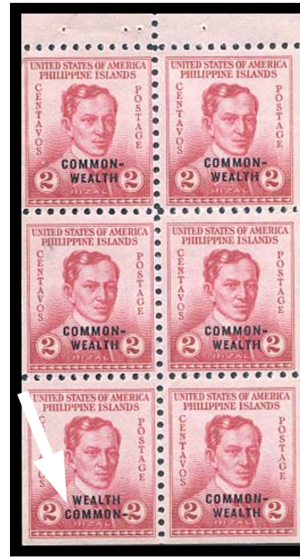
TRANSPPOSED CLICHÉ ON THE LL STAMP WEALTH ABOVE COMMON -