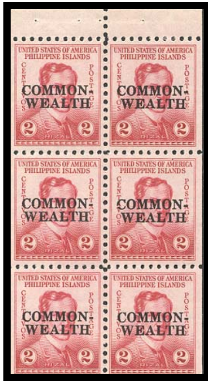
LARGE SIZE COMMON - WEALTH OVERPRINT