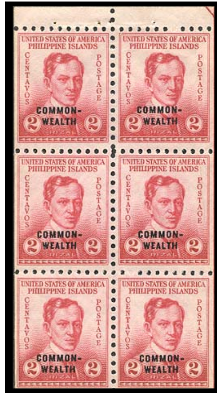
SMALL SIZE COMMON - WEALTH OVERPRINT