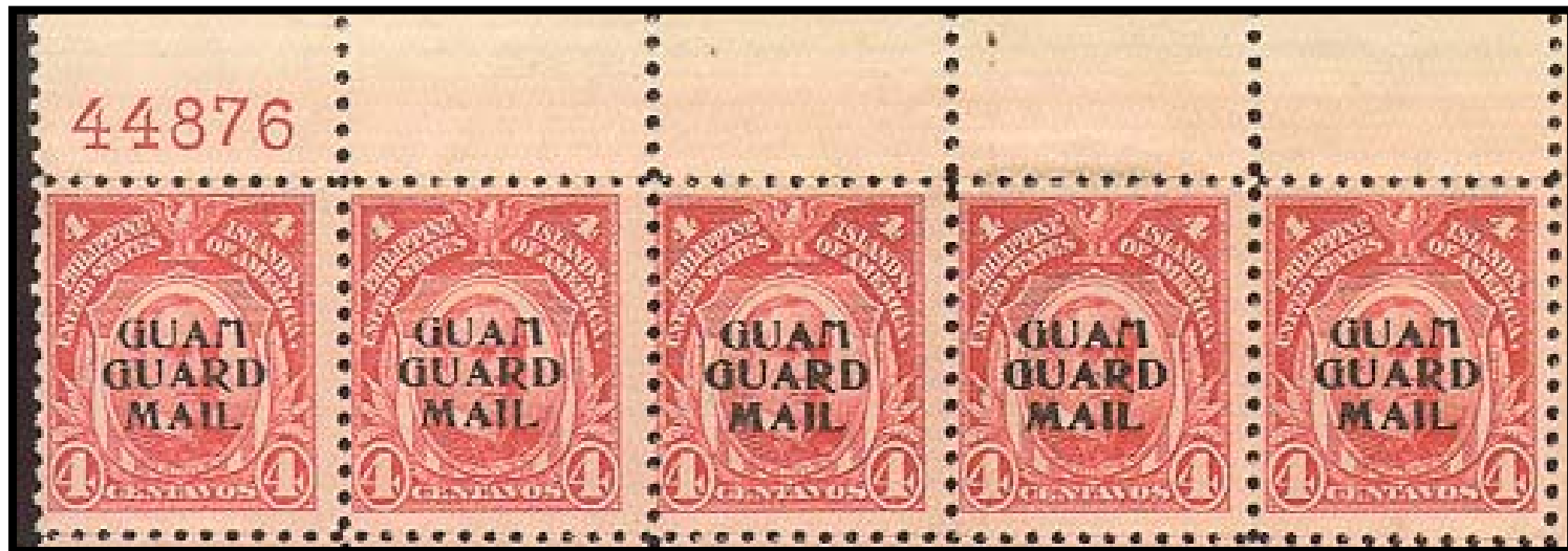
First Issue (April 1930) – Small Size Overprint GUAM GUARD MAIL