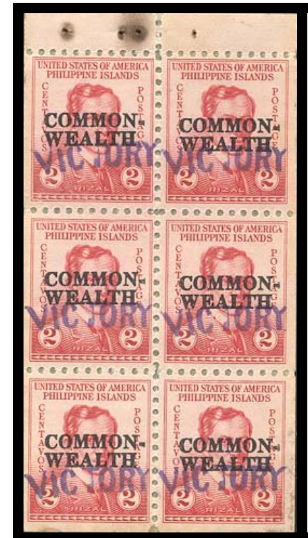
HANDSTAMPED VICTORY Type II IN VIOLET INK