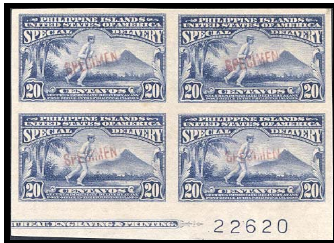
HANDSTAMPED SPECIMEN IN RED INK.