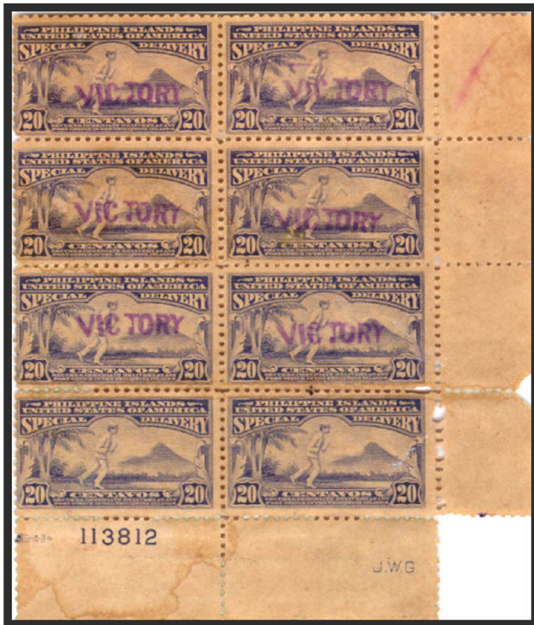
VERTICAL BLOCK OF EIGHT BOTTOM PAIR WITHOUT THE VICTORY HANDSTAMP